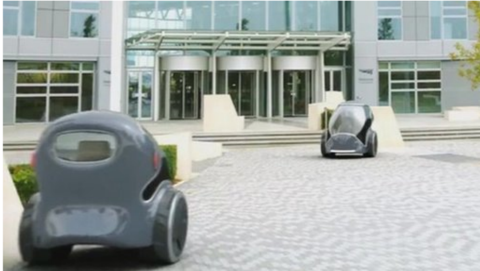
Milton Keynes will introduce driverless pods

The government has announced that it wants to make the UK a world centre for the development of driverless cars.