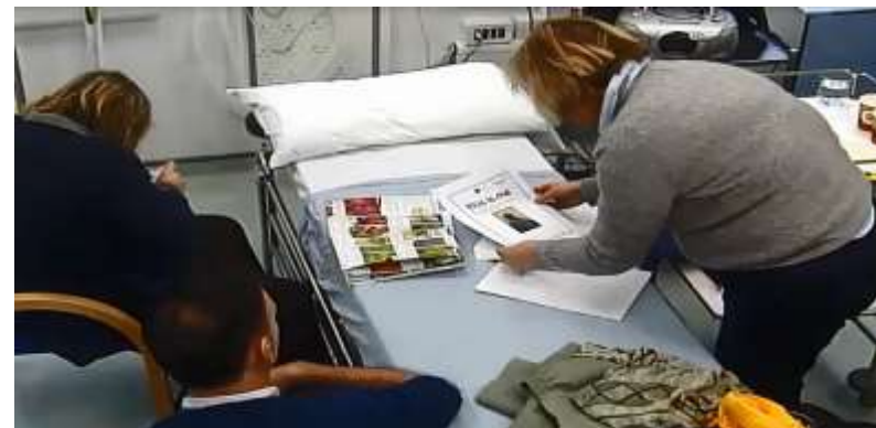
OUH host multidisciplinary and multiagency DEALTS programme January 2015

Simulation and dementia leads working together :