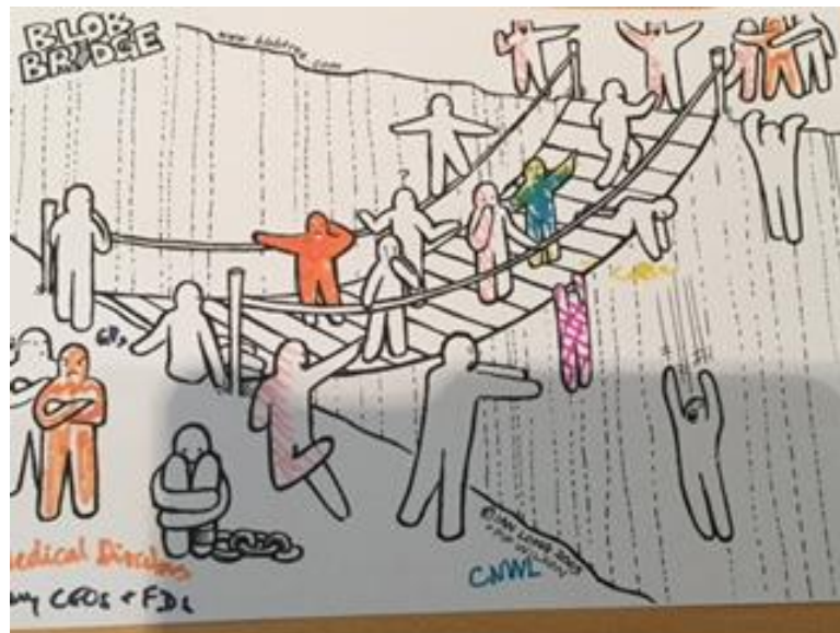
Picture 1 One group's version of the bridge exercise

Many felt that they were on the bridge, engaged and interested in outcomes that matter to patients and the public, but needed direction and support (methodological, organizational, leadership, cultural) and were keen to learn more.