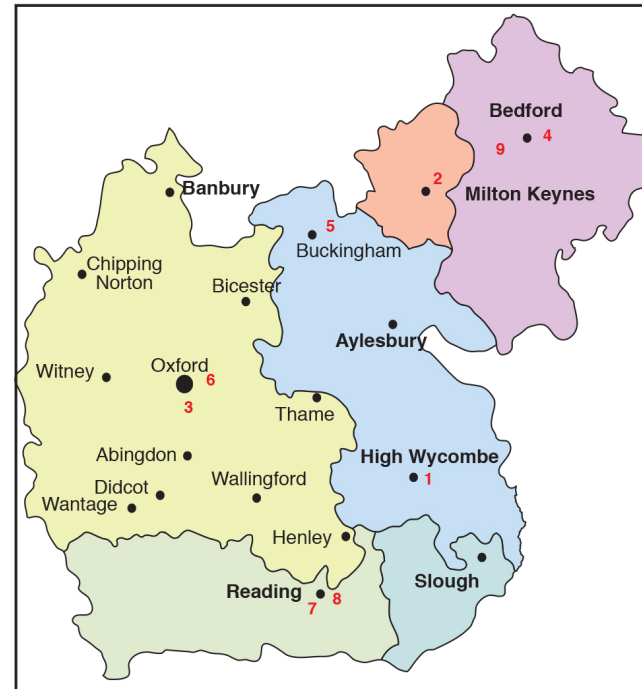
Universities within the Network