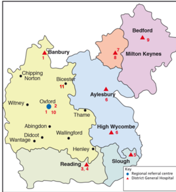
NHS Trusts within the Network