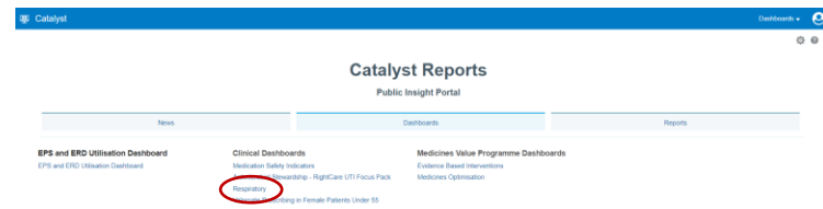
Figure 2. Finding the Respiratory dashboard

To find the Respiratory dashboard, When you have logged on, select the 'Respiratory' from the Dashboards tab (Figure 2).