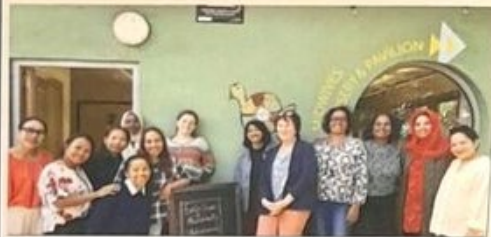
Launch of the Equal Start Maternity Advocates programme